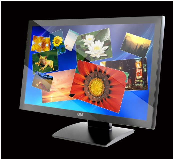
18.5-inch 3M™ Multi-Touch Display M1866PW

Not finding a multi-touch display to meet all of these requirements, led the paint manufacturer to continue their search for a solution.