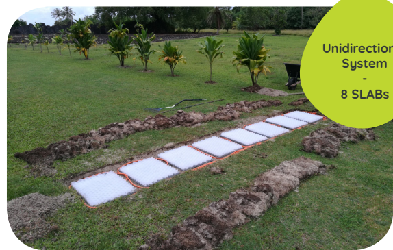
Unidirectional system with 8 SLABs, without direction detection and with honeycomb overlay